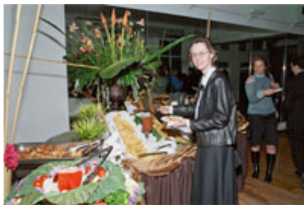
January Event